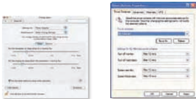
Macintosh (left) and Windows (right) energy saver settings.